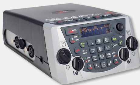
SCOOPY+ S (2015)