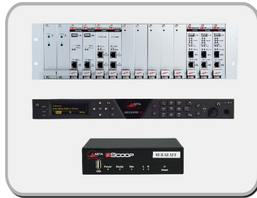
Audio transmission codecs for all types of broadcast applications