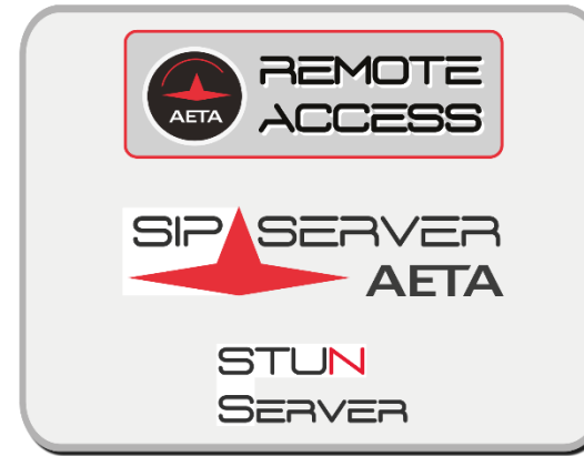
Control and safety with our broadcast oriented services