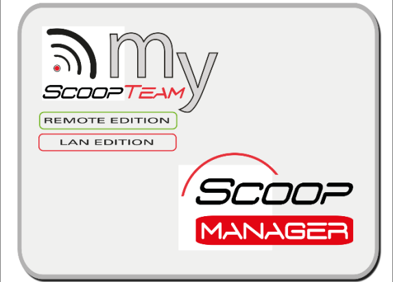
Software solutions to simplify the use of AETA codecs