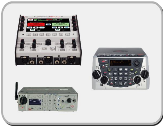
Audio and IP codecs for field reports and commentaries